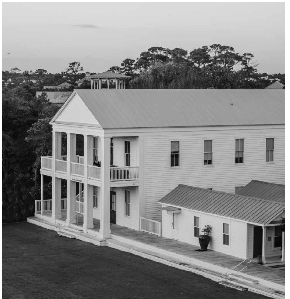
Points of interest on the Seaside Institute's self-guided walking tour include the Assembly Hall (above), the Tupelo Street Gazebo (below right) and the West Ruskin Beach Pavilion (bottom).

The Seaside Institute is offering the new Dhiru Thadani book: "Reflections on Seaside" through the Seaside Institute store. The sequel to the critically acclaimed "Visions of Seaside" (2013), Reflections on Seaside celebrates the fortieth anniversary of the town of Seaside, returning to the place that has inspired countless designers, architects, urban planners, and everyday citizens in the search