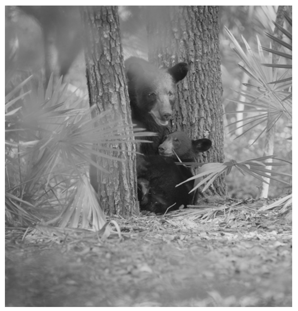
"The Paper Bear" film combines live actiion with animation.

"The Paper Bear" is a film project set to release in 2024 that combines live action film and old school animation, and features our Florida black bear. The collaboration between the Seaside Institute and "The Paper Bear" is a testament to fostering creativity and encourag-