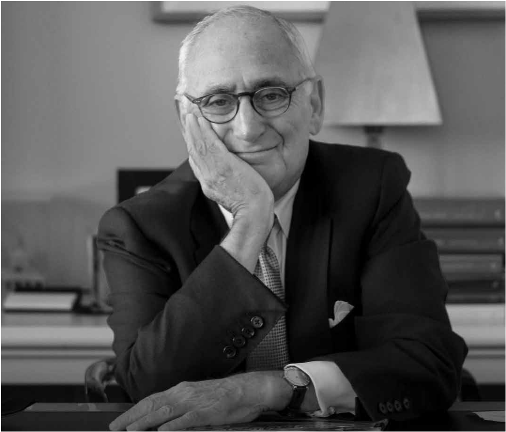
Robert A.M. Stern

In Dhiru Thadani's book, "Visions of Seaside" (Page 75) is an essay by Stern titled, In Praise of Invented Towns where he writes, "What makes Seaside so compelling? On the one hand, it is a resort -- a good time place, a wonderful beachfront site, where one can escape from all the stresses, rigors, and obsessions of big-city life. On the other hand, it is a town, as urban as any. Perhaps what strikes me most about Seaside is how these two aspects are related: a "resort town" replace with the rich measure of contradiction the phrase implies. Resorts are places of escape, yet they are often idealized versions of what we left behind at home, or what we would like to have